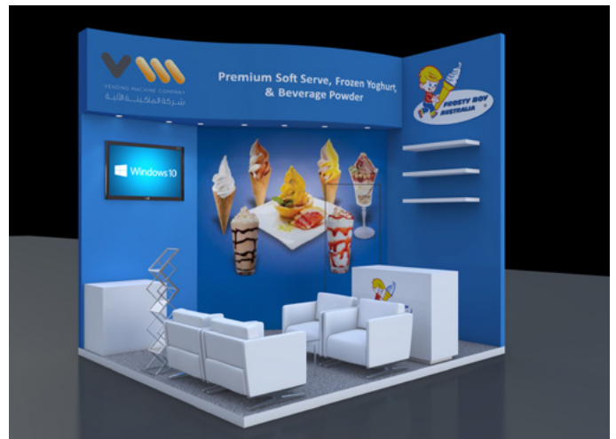
Image of a custom build stand at Dubai World Trade Centre

This information is a guide only – refer to the stand documentation for complete details of the build and furniture inclusions.