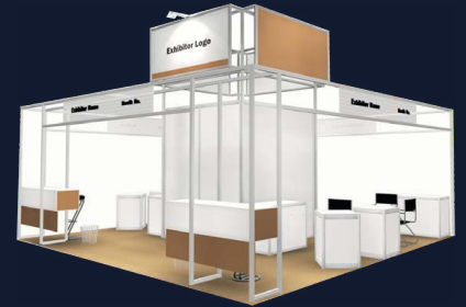
Premium Island Package (minimum 36sqm)