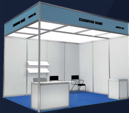
(Minimum 9 sqm)