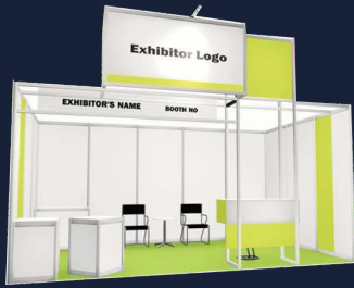
Premium Centre Package (minimum 18sqm)