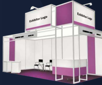
Premium Corner Package (minimum 18sqm)