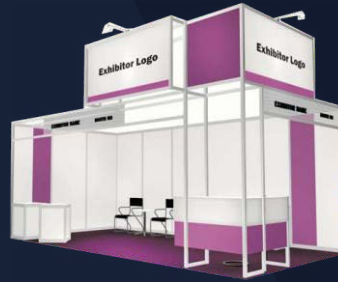
Premium Corner Package (minimum 18sqm)