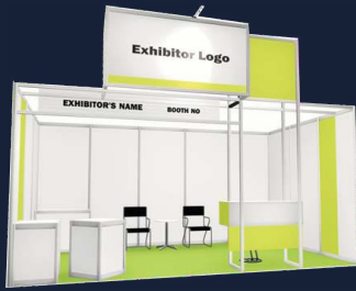
Premium Centre Package (minimum 18sqm)