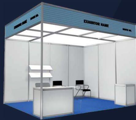
(Minimum 9 sqm)