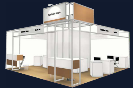
Premium Island Package (minimum 36sqm)