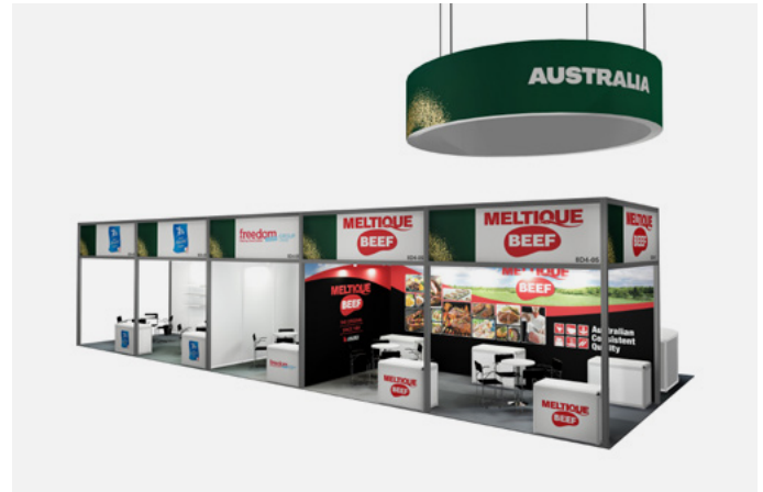
Illustrative design only