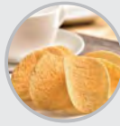
Leisure Food & Beverage