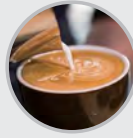
Coffee & Tea