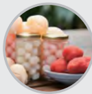
Canned Food & Raw Materials, Machinery and Equipment