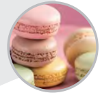
Sweets & Chocolate