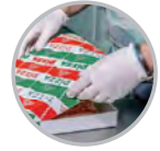
Food Processing & Packaging