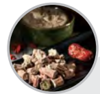
Food & Medicine Homology