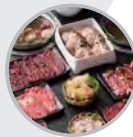
Hot Pot Ingredients & Supplies