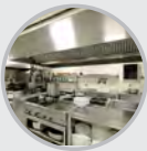
Prefabricated Dishes & Central Kitchen