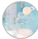
Baby & Child Food Products