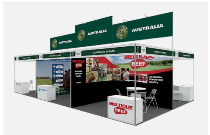
Illustrative design only