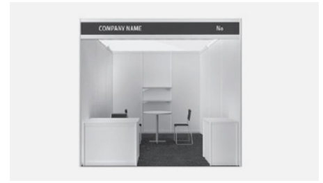
Illustrative design only

Participation costs: Price starts from SGD 5,625 for a 9sqm stand.