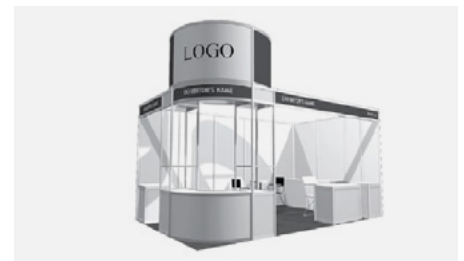
Illustrative design only

Participation costs: Price starts from SGD 11,610 for an 18sqm stand.