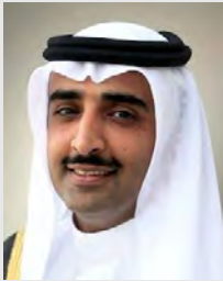
H.E. Shaikh Mohammed bin Khalifa Al Khalifa Minister of Oil, Kingdom of Bahrain