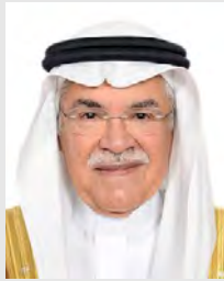
H.E. Ali Al-Naimi Former Minister of Petroleum and Mineral Resources & Current Advisor to the Royal Court, Kingdom of Saudi Arabia