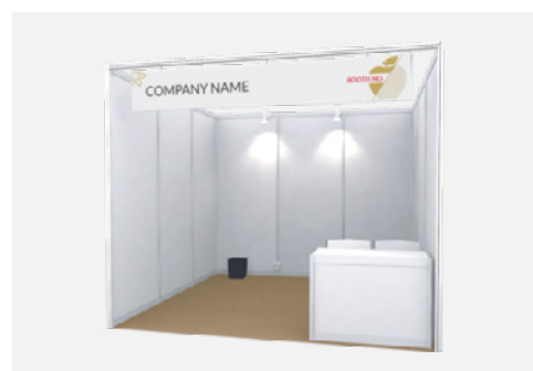
Illustrative design only

Participation costs: Price starts from USD 5,040 for a 9sqm stand.