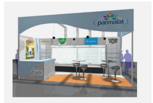
Illustrative Custom build at HOFEX