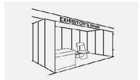
Illustrative design only

Participation cost: Price starts from USD 595 per sqm for a 9sqm stand.