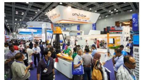
Custom build example at OGA

Participation cost: Price starts from USD 550 per sqm for space only.