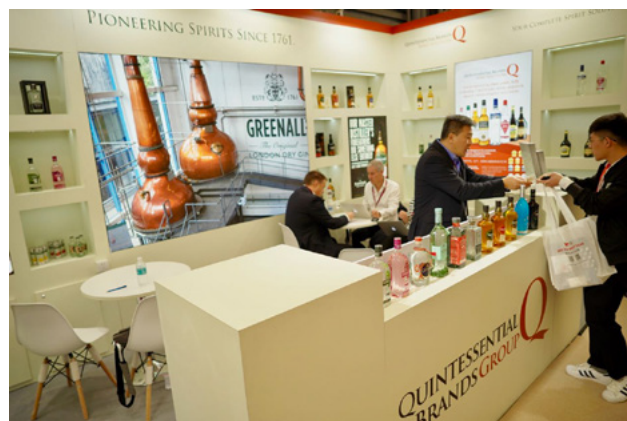
Custom stand design at ProWine China

This information is a guide only – refer to the stand documentation for complete details of the build and furniture inclusions.