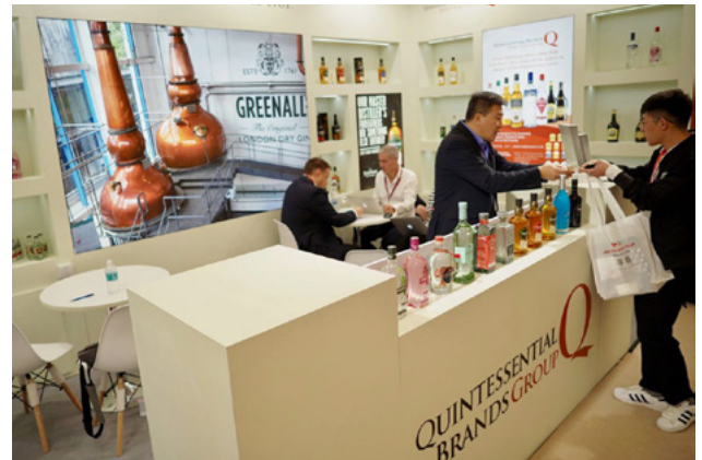
Custom stand design at ProWine China

This information is a guide only – refer to the stand documentation for complete details of the build and furniture inclusions.