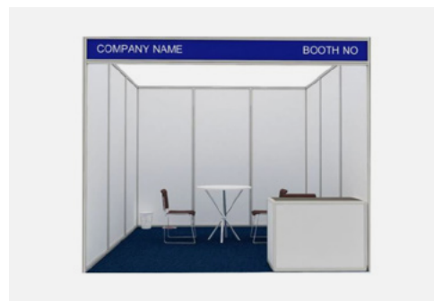
Indicative example custom build

Participation cost: Price starts from SGD 5,040 for a 9sqm stand.