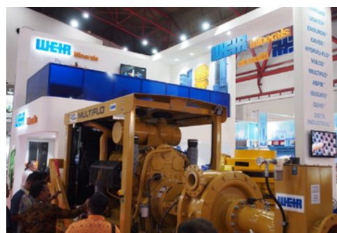
Illustrative design only

This information is a guide only – refer to the stand documentation for complete details of the build and furniture inclusions.