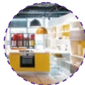
Catering & Intelligent Shop Design