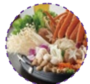
Hotpot Ingredients & Supply