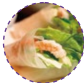
High-end Food Supply Chain