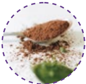
Condiments & Oil