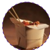
Food Packaging & Design