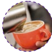
Bakery & Light meals; Coffee & Tea