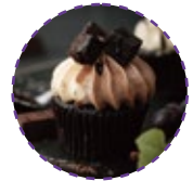
Leisure Food, Sweets, Chocolate