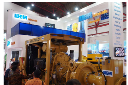
Illustrative design only

This information is a guide only – refer to the stand documentation for complete details of the build and furniture inclusions.